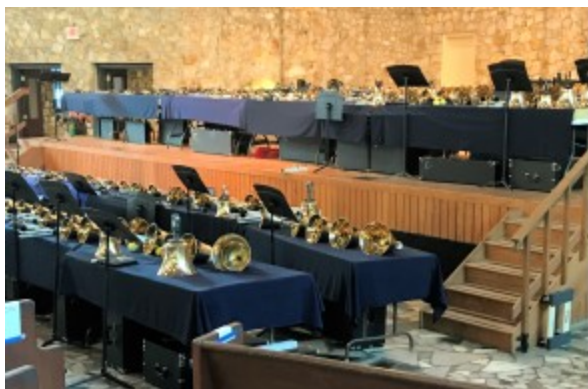
Anderson Auditorium at Montreat