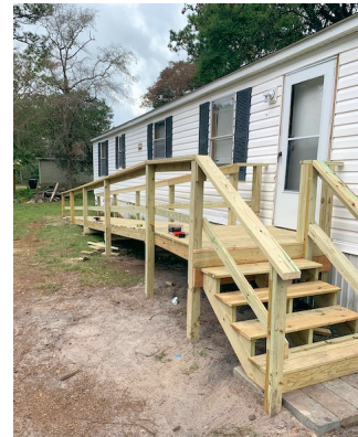
Another fine job.