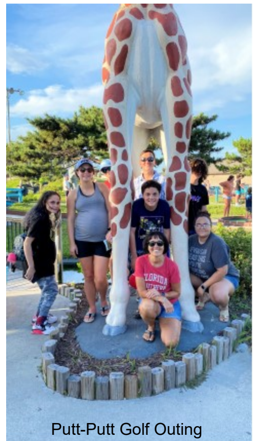
Putt-Putt Golf Outing