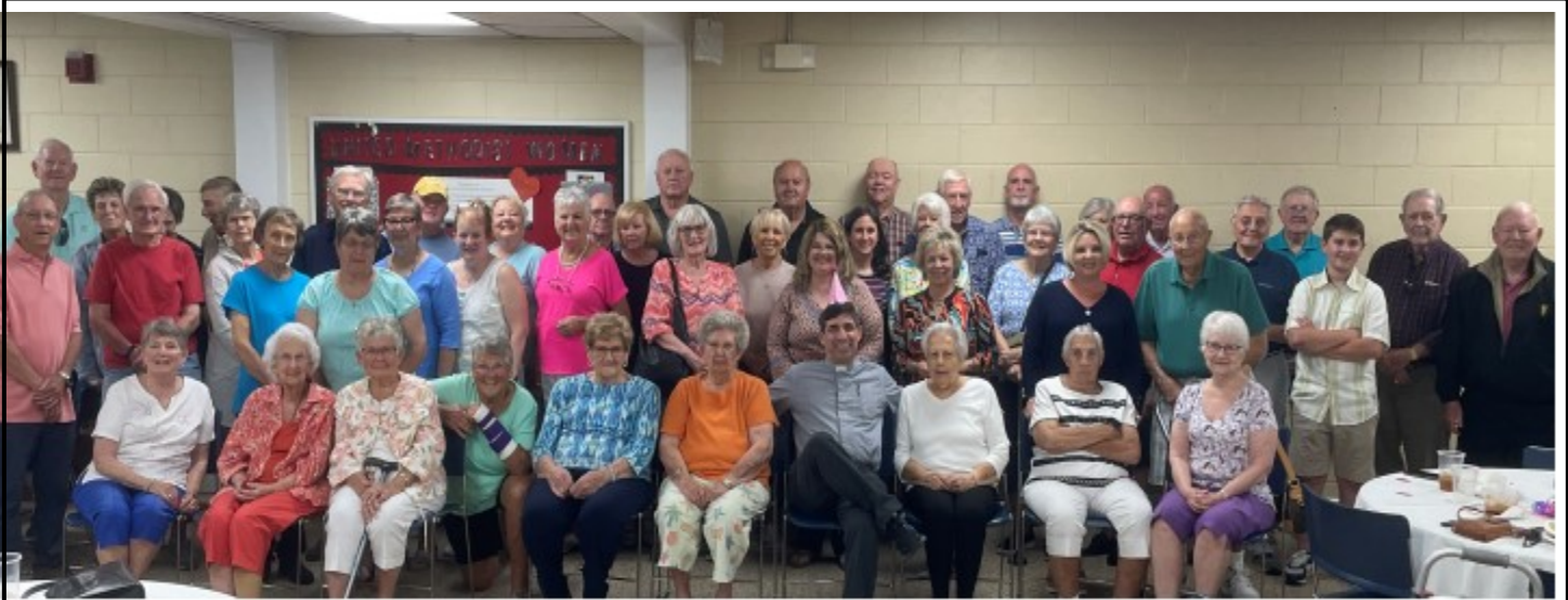
The group at the April SALT Event