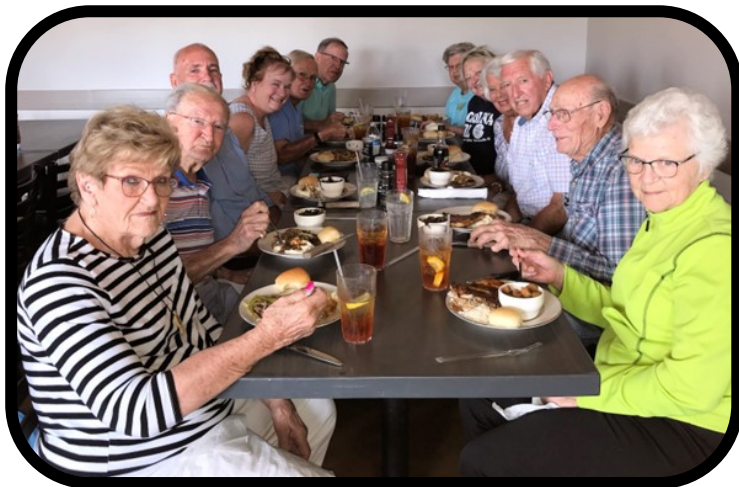
Members of the Salmon Class enjoy a meal at Chances Restaurant. The plan is to for members to meet every Wednesday for food and fellowship

YOU COME FROM DUST, YOU WILL RETURN TO DUST. THAT'S WHY I DON'T DUST. IT COULD BE SOMEONE I KNOW.